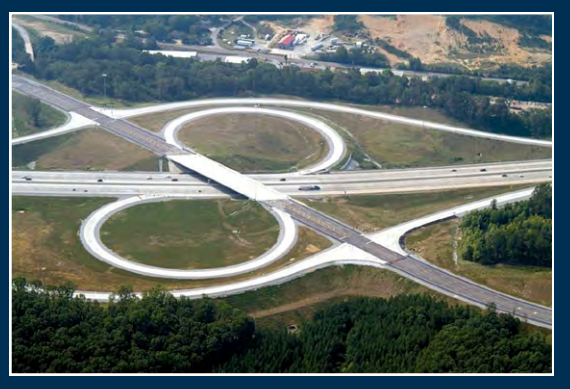
I-75 Interchange at Volkswagen Drive

Serving Clients Through Successful Engineering Solutions