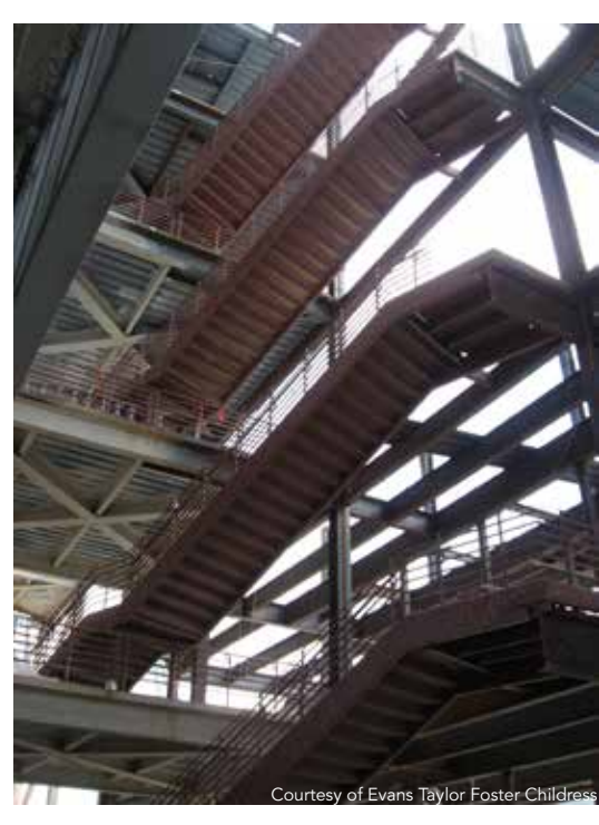
▲ The exposed monumental stair, under construction.